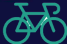
Indoor Bike Storage