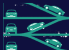
Multiple levels of Underground Parking