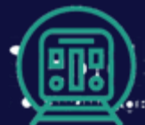
Proximity to Public Transportation